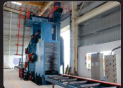
Shot Blasting Machine