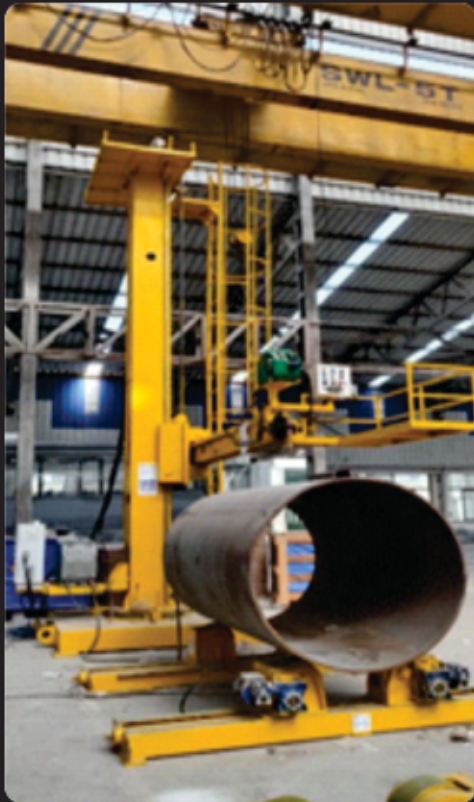
Welding Column and Boom