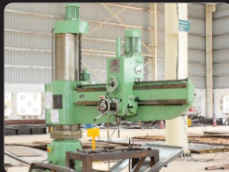
Radial Drilling Machine